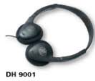
DH 9001 Operator headphone