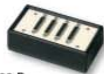
JB 9000 P Junction box, portable to connect the units in the booth