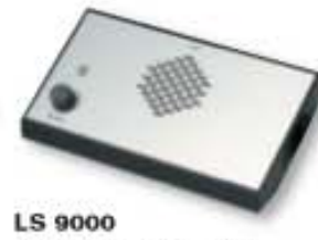
LS 9000 Loudspeaker inside the interpreter booth