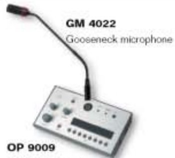
OP 9009 Operator's panel