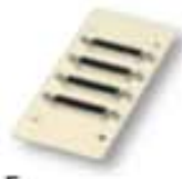
JB 9000 F Junction box for fixed installations