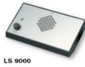
LS 9000 Loudspeaker