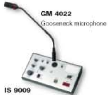
IS 9009 Interpreter's set