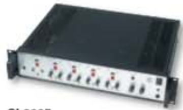
CI 9005 Conference infrared transmitter - 5 channels. Two combined forms a 9 channels system